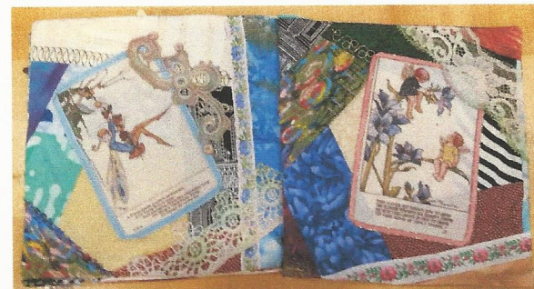
FRONT COVER WITH BINDING